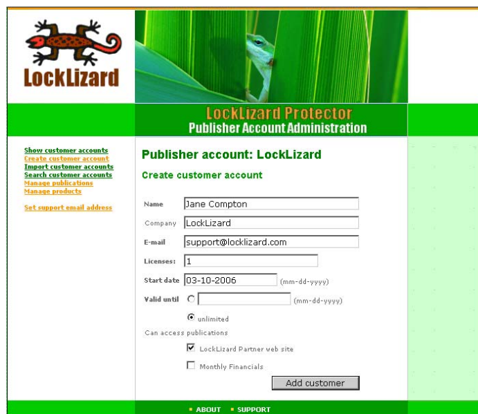
Diagram 2: Secure Web Based Administration System